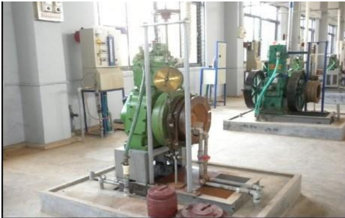
Thermal Engineering Lab