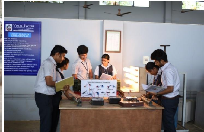
Process Control Lab