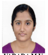
VARADA M V

(Funded by the Ministry of HRD, Govt. of India)