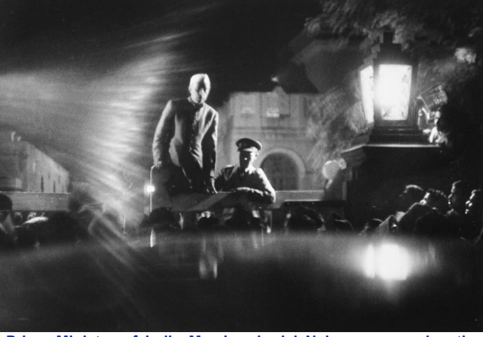
Prime Minister of India Mr. Jawaharlal Nehru, announcing the death of Mahatma Gandhi at the Birla house on 30 Jan. 1948 nearing mid-night.

The above shown two photographs were taken by Henri Cartier-Bresson (Aug. 22, 1908 – Aug. 03, 2004) who was a French humanist photographer considered as the master of candid photography, and an early user of 35 mm film. He pioneered the genre of street photography and viewed photography as capturing a decisive moment . He was one of the founding members of Magnum Photos in 1947. In the 1970s he took up drawing, he had studied painting in the 1920s. His photographs, paintings and himself have been subject for more than 50 books from 1946 till today. He has directed 6 art films and 3 films have been taken on His life history and his works. 9 films have been compiled from his photographs.