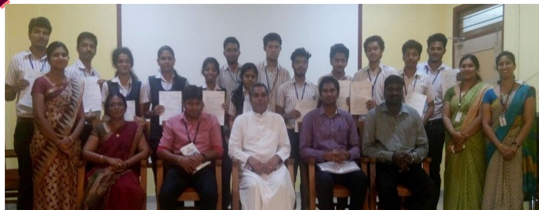
S7 EEE students placed in First Source Solutions Ltd., with the company team and staffs