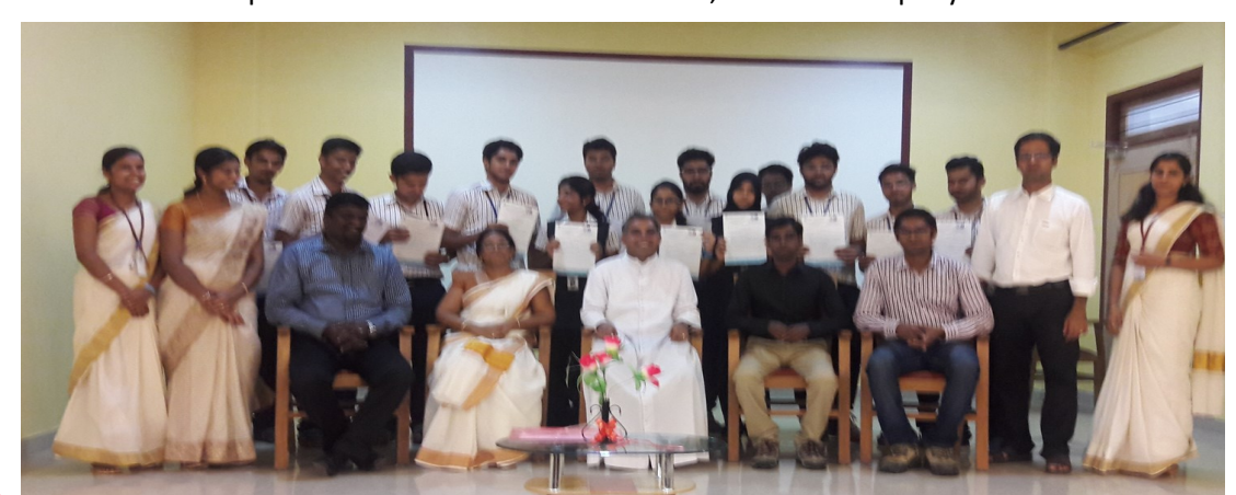
AUQA PURE PLUS Pvt. Ltd recruiters with S7 EEE students placed in their firm and staffs