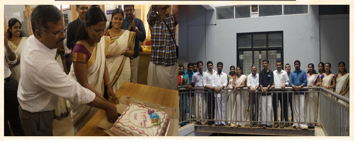
Dept. of EEE celebrated Onam 2014 & Teacher's day on 5th September.