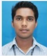
Hredudev E M ME(2014-2015) RELIANCE