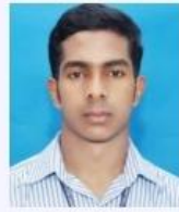
Dalin Manual ME(2014-2015)