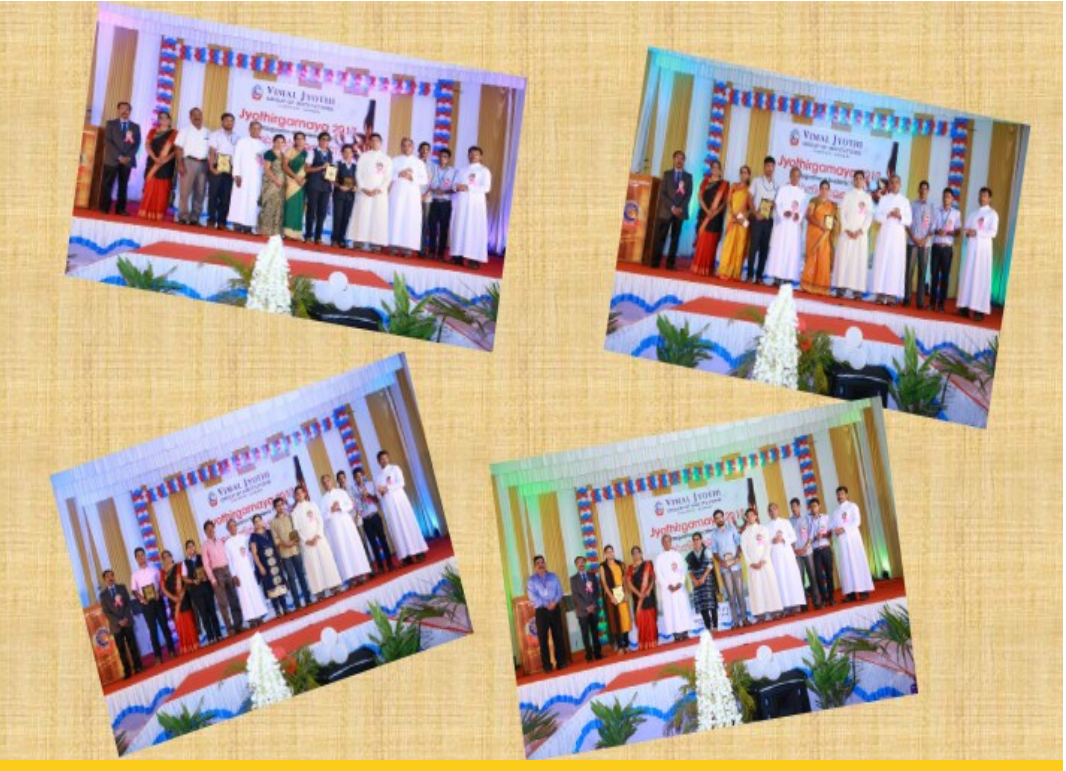
University Toppers in each batch of EEE receiving their awards