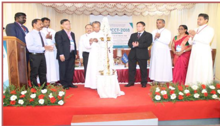
Inauguration of IEEE international conference ICCPCCT 2018 on 23rd & 24th March 2018 at VJEC.