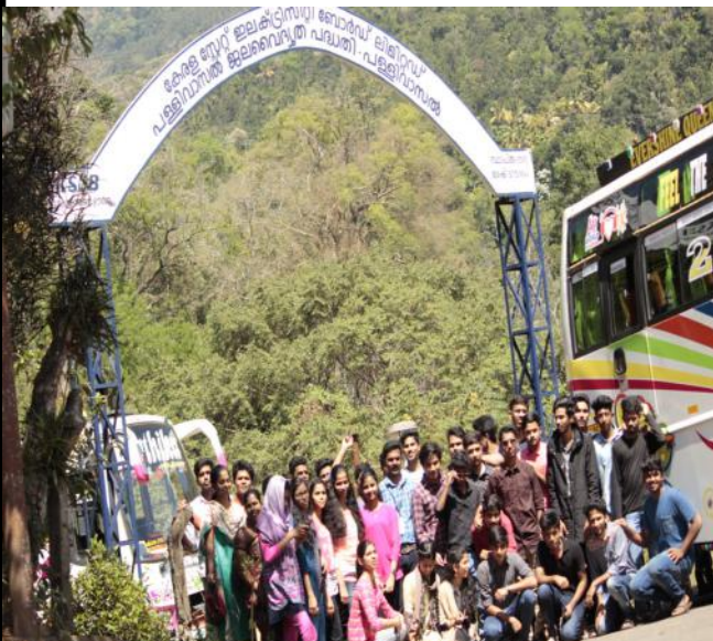
S2 EEE students at Pallyvasal Hydro Electric Power