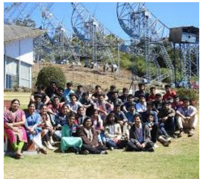
S4EEE students at Radio Astronomy centre at