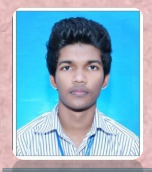
ADARSH P K GODDSMATTHEW GROUP ILLUMINE ENERGY SOLUTIONS