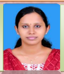
AP, EEE Completed her B.Tech in EEE from Rajagiri School of Engineering & Technology M.Tech in Power & Electronics Power Systems from NIT Goa.