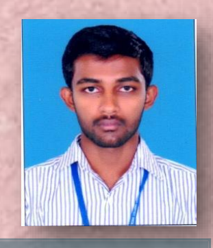
JIBIN C J ILLUMINE ENERGY SOLUTIONS