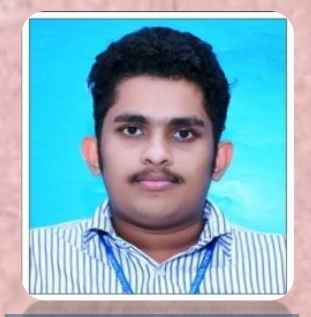
SACHETH SANAL EVOBI AUTOMATION ACCENTA EDUCATION