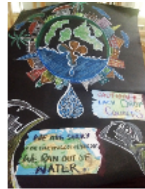
First prize in Poster Making Contest