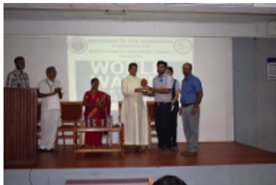
Token of appreciating the GATE qualified students