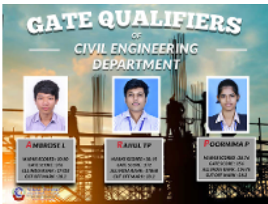
Students who qualified GATE exam 2019

There is no secret of success. It is the result of preparation, hard work and learning from failure. Well done !!