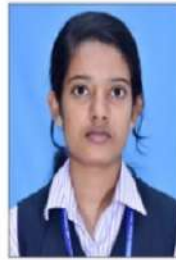
Similiya T K IBS, Accenta