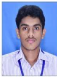
Anjunath D CMS