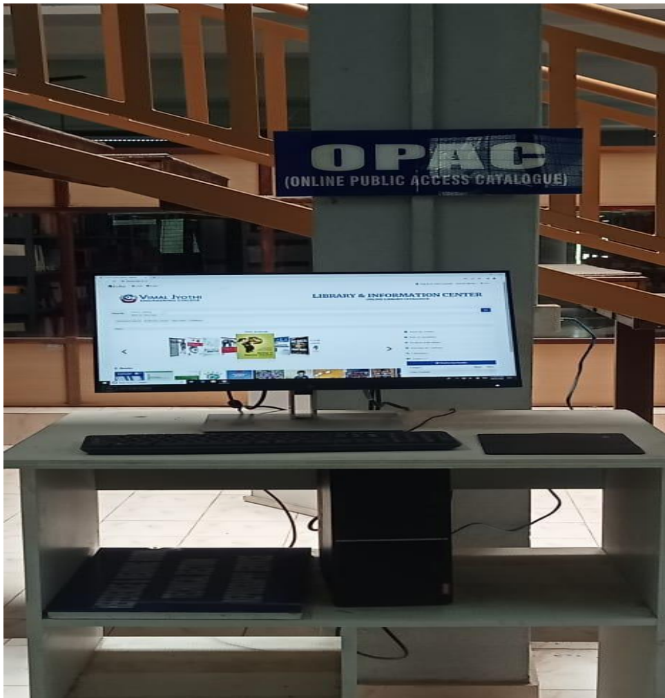
OPAC-Online Public Access Catalogue