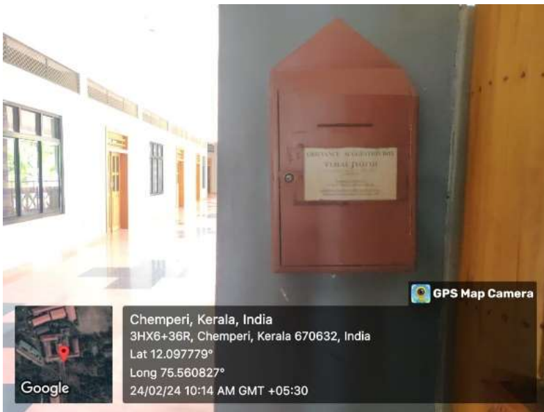
Grievance/Compliant/Suggestion Box near College Reception

They can also hand over written complaints/grievances to Principal, HODs, Mentors, Grievance Redressal Committee Members, Internal Complaint Committee Members, & Anti ragging Committee Members whose details are displayed on various notice boards