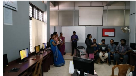
Introduction to aurdino and hands on training