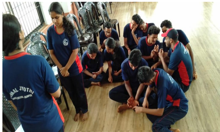
Nadakakalari at GUPS school cheriya arikkamala by NSS volunteers