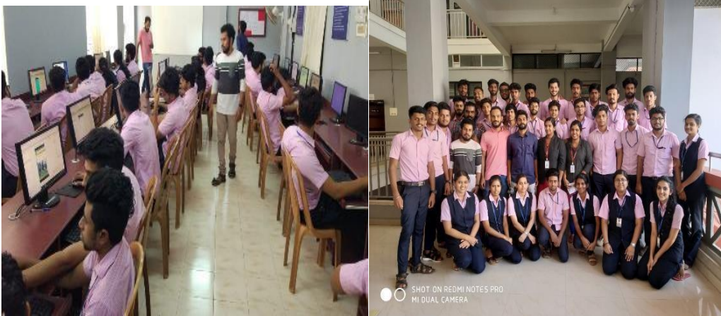
Rapid prototyping by IEEE students