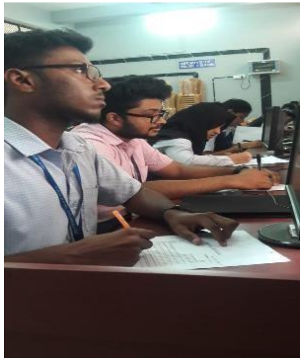
Science day celebration by IEEE students