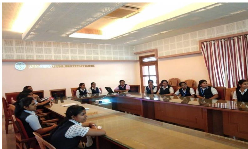
Women in technology conducted by IEEE students