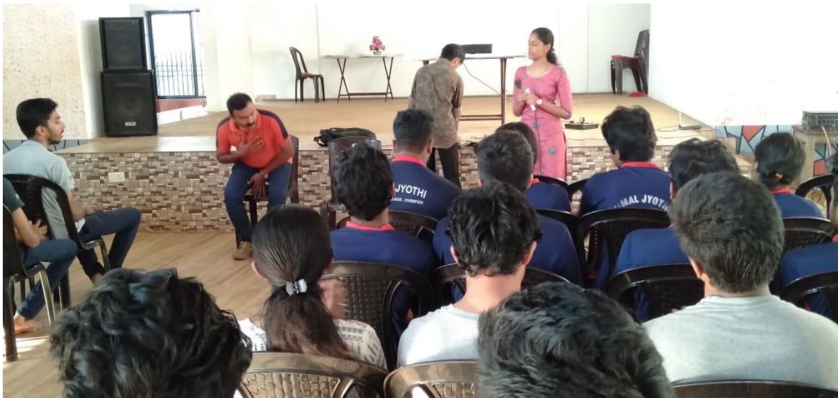
Nadakakalari at GUPS school cheriya arikkamala by NSS volunteers