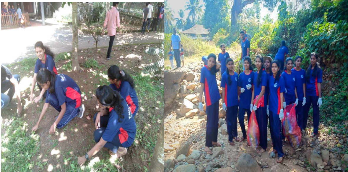
Arikkamala town cleaning by NSS volunteers

Arikkamala town cleaning by NSS volunteers of unit 194