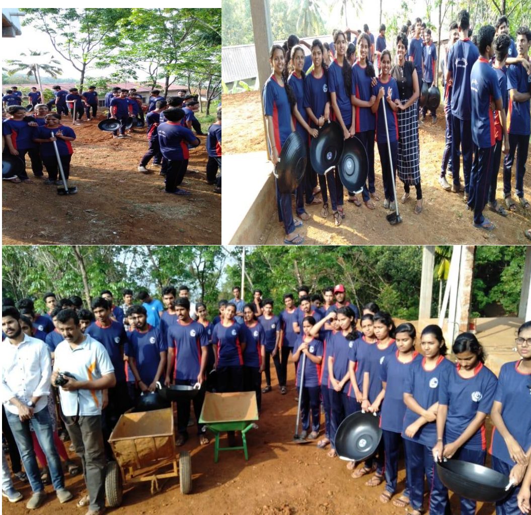
Renovation of GUPS school cheriya arikkamala

NSS volunteers actively participated in renovation of GUPS Cheriya Arikkamal