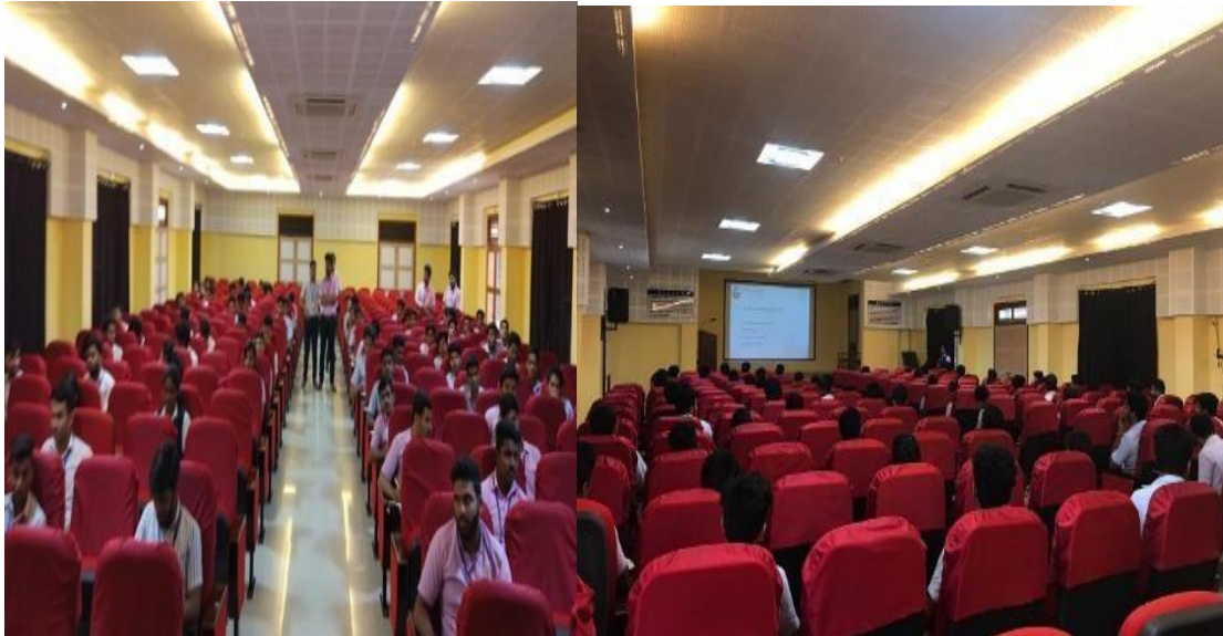
Science quiz by IEEE students