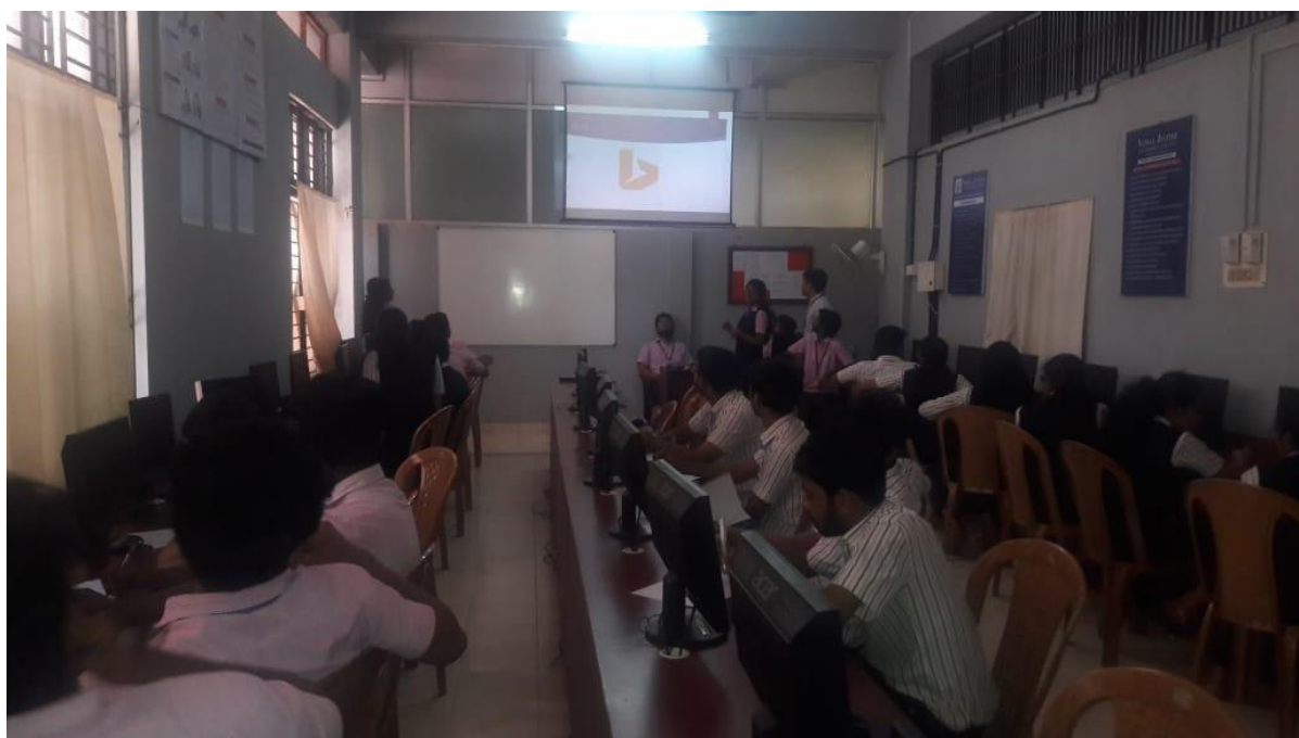
Logo quiz competition by IEEE STUDENTS