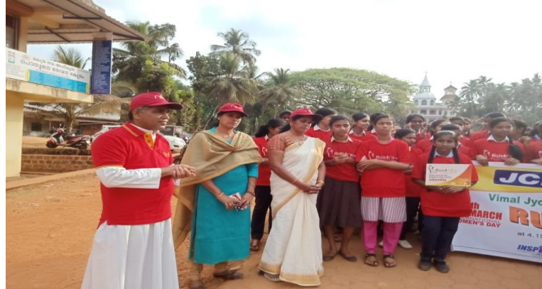
day celebration by nss