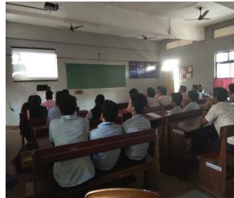
Movie review contest by IEEE students