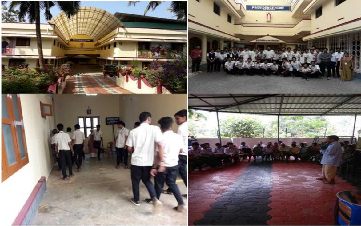
Karunalayam visit by vimal Jyothi students