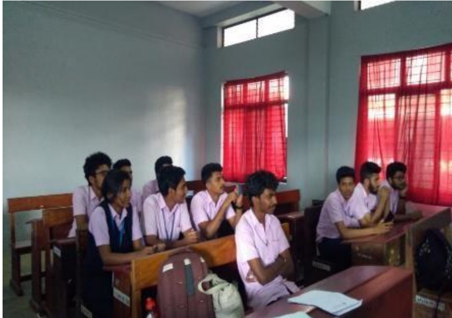
Science day celebration by IEEE students.