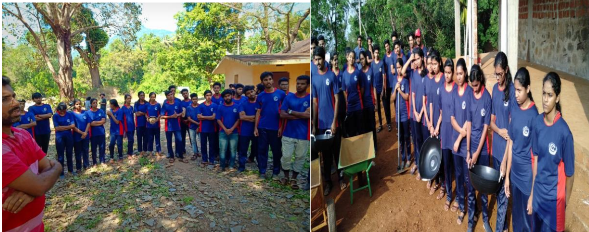
Renovation of GUPS school cheriya arikkamala