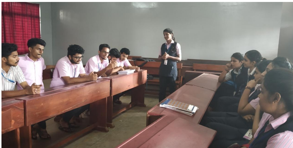
Women's day celebration by IEEE students