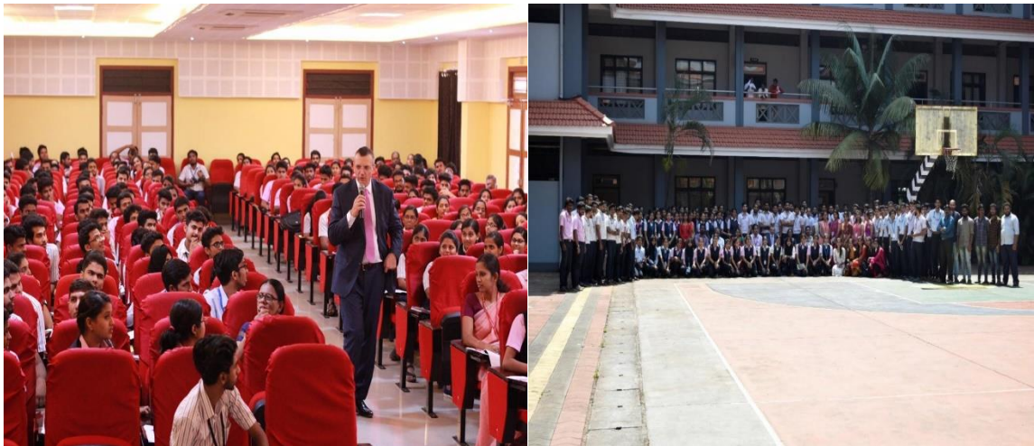
Lecture programme by IEEE students