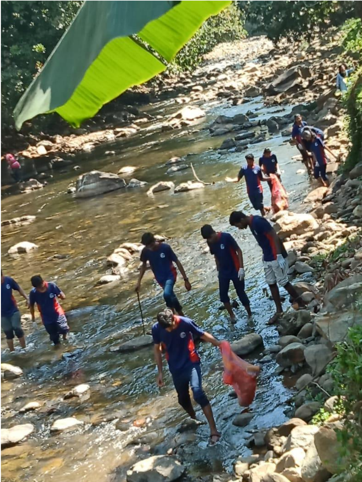
by NSS students at Kottiyoor river ( January 2020 ).