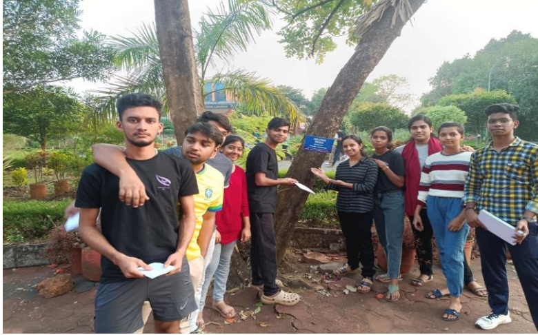
Tree Tagging at Vimal Jyothi Campus