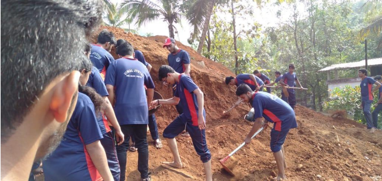
NSS Residential camp work at Areekkamala ( January 2020 ).