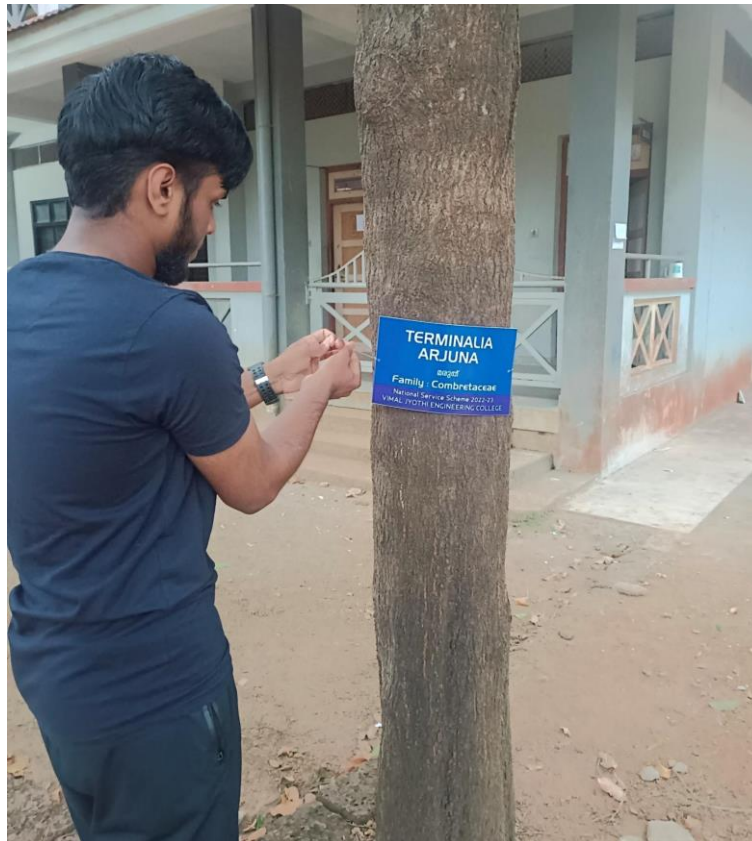
Tree Tagging at Vimal Jyothi campus