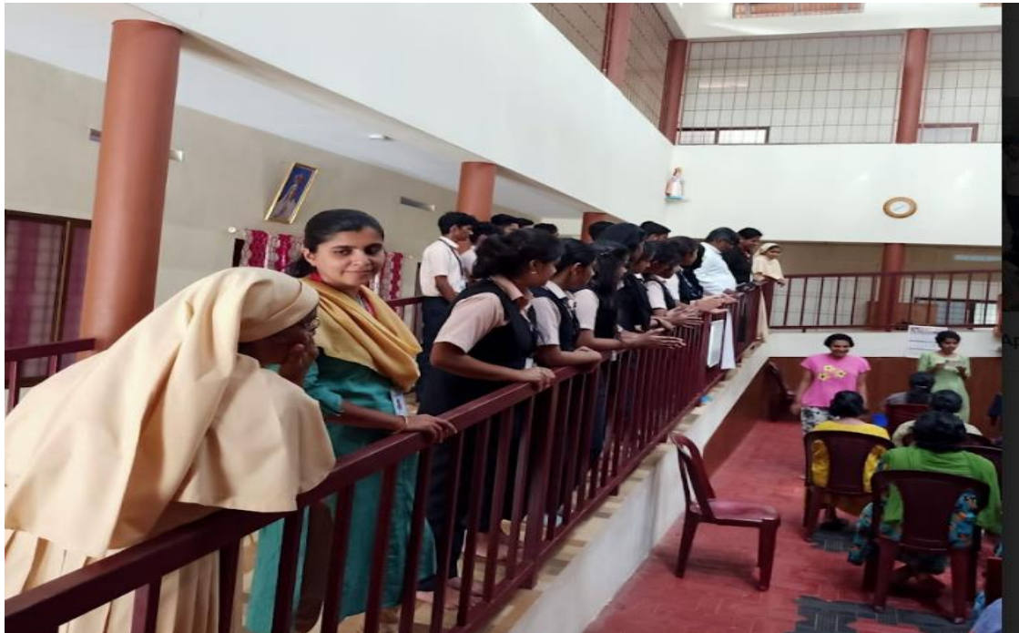
NSS & UBA Members Visited Sneha giri Psycho Social Home ,Pooparamba