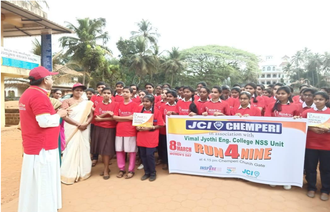
Women Empowerment Programme on Women's day by NSS students in association with JCI Chemperi ( 8 March 2019