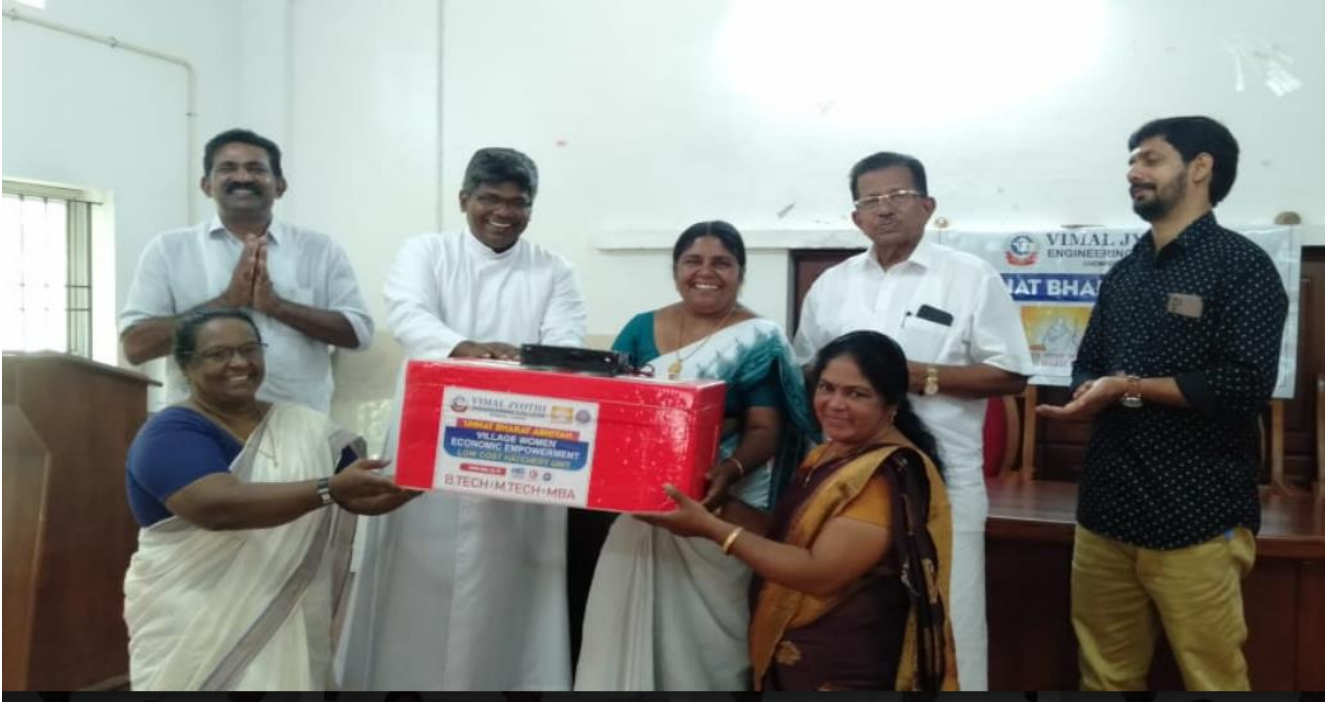
Handover the Hatchery unit developed by vjec students to Eruvessy Grama Panchayath authority.