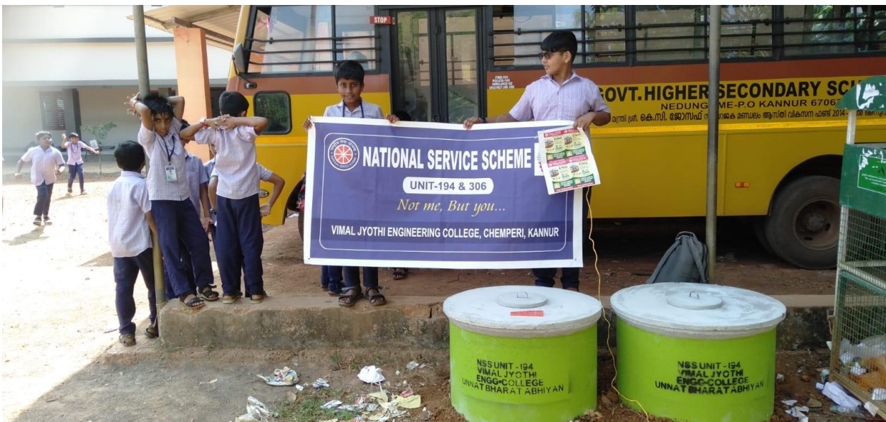
Waste bin distribution at GHSS Nedungome ( February 2023)