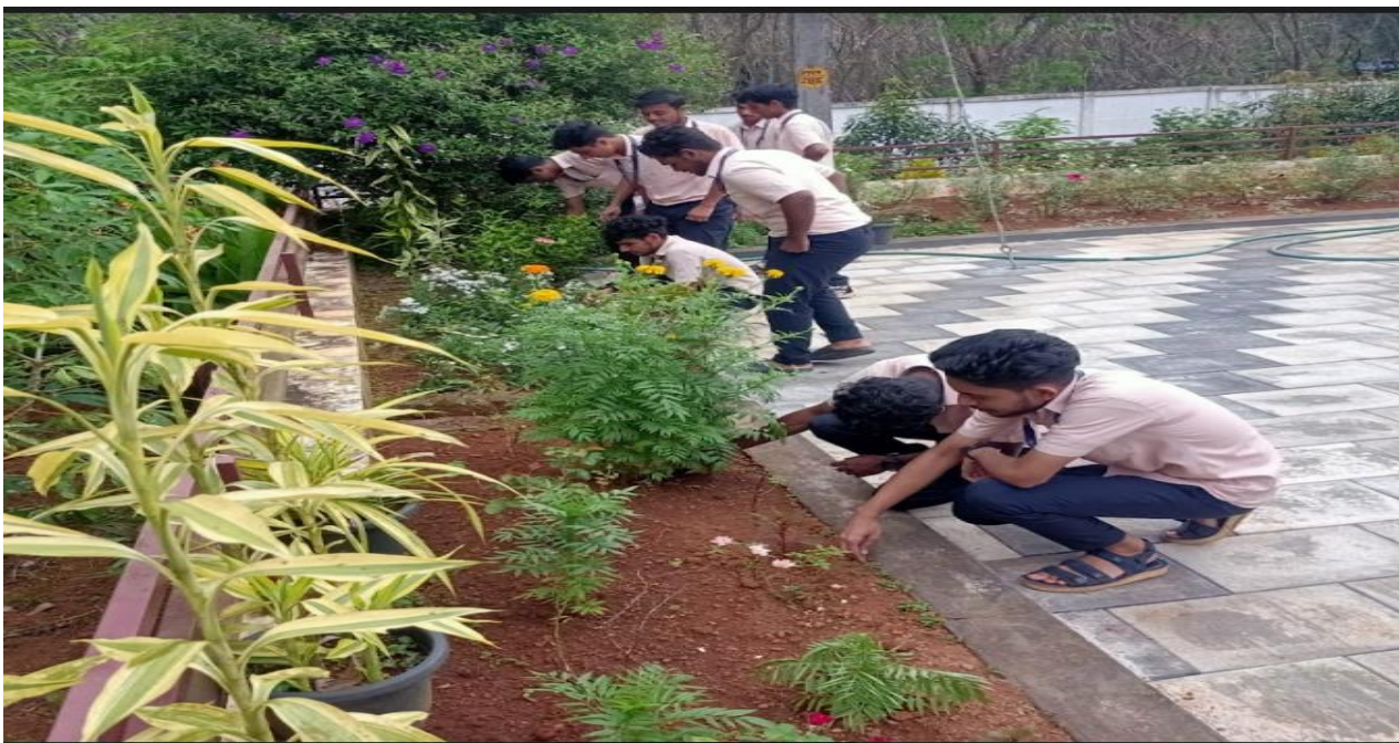
NSS & UBA Members Visited Sneha giri Psycho Social Home ,Pooparamba