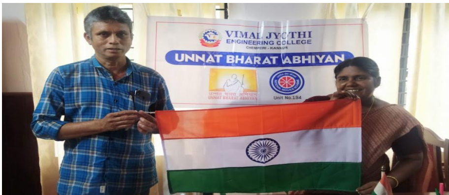
Independence Day Celebration: Flag Distribution by Panchayath President.

We celebrated Azadi Ka Amrit Mahotsav with the villagers by distributing National Flag to the villagers to fly the tri color in their houses. The Occasion was marked with a Special Gram Sabha Where-in the Panchayath president, Ward members, Panchayath Officials, the college authorities and village representatives were present.