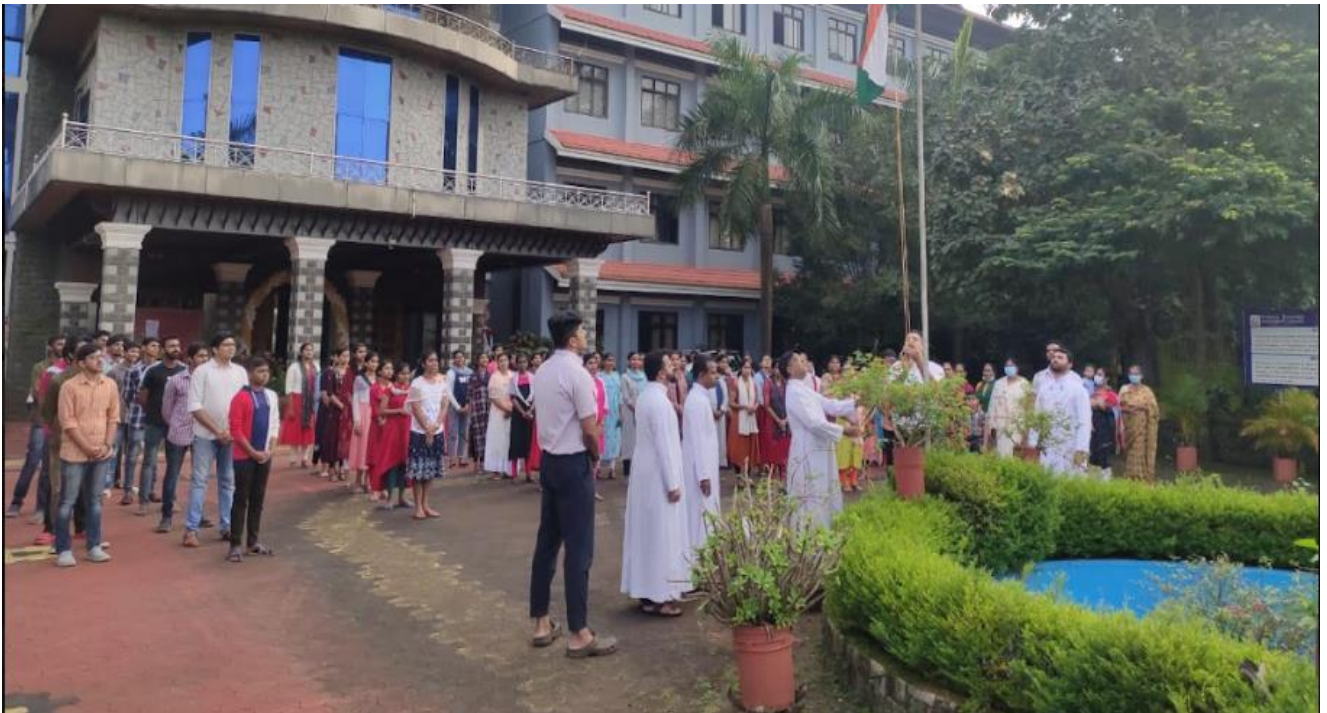
Flag Hoisting held at Vimal Jyothi Campus