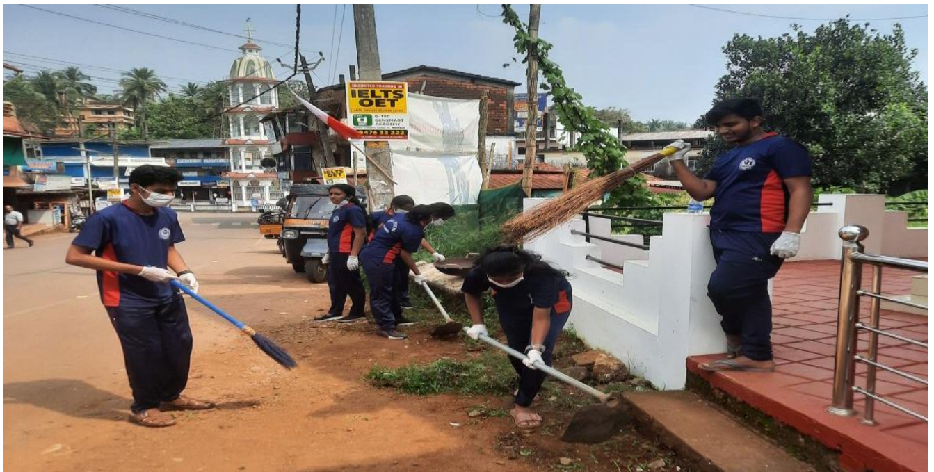
Chemperi town cleaning by VJEC NSS UNITS (18/12/2022)