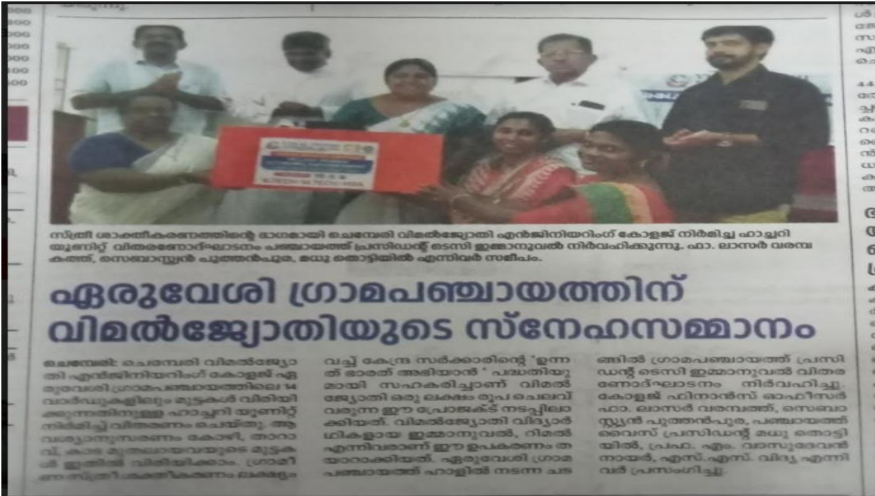
News came in the news paper about the distribution of Egg Hatching Unit