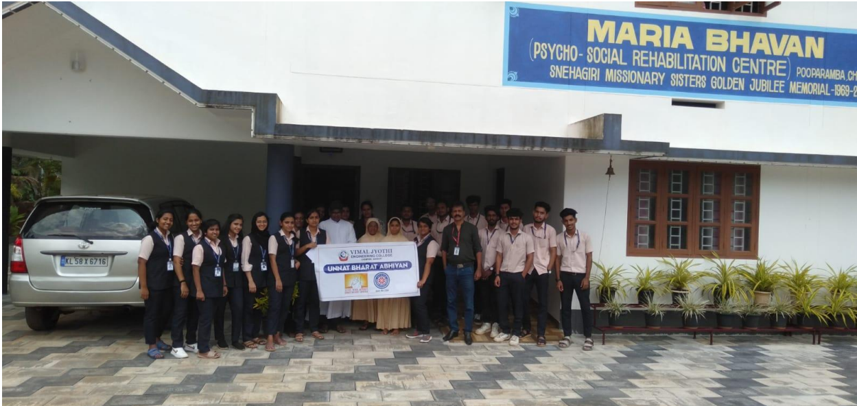
NSS students visited Maria Bhavan on World mental health day (10 October, 2022)