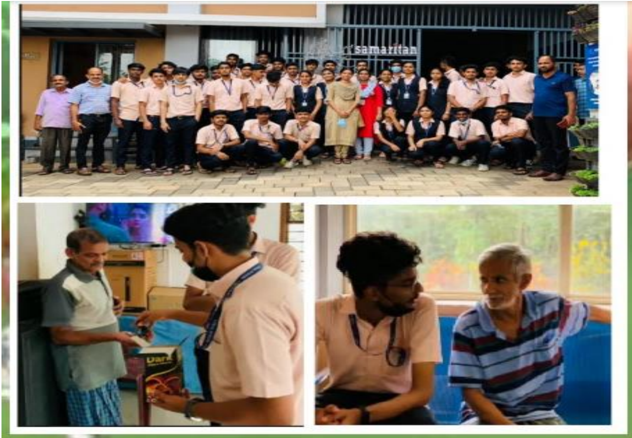
Charity Pilgrims visit conducted by NSS units, visited various old age homes of Kannur district, Samaritan Home Chengalayi