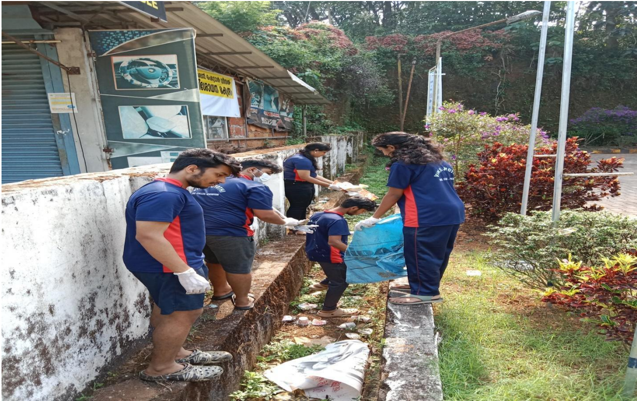
Chemperi town cleaning by VJEC NSS UNITS (18/12/2022)