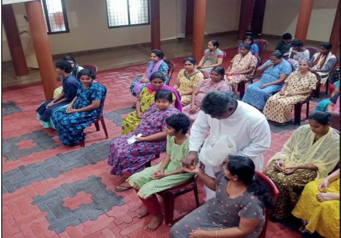
NSS & UBA Members Visited Sneha giri Psycho Social Home ,Pooparamba