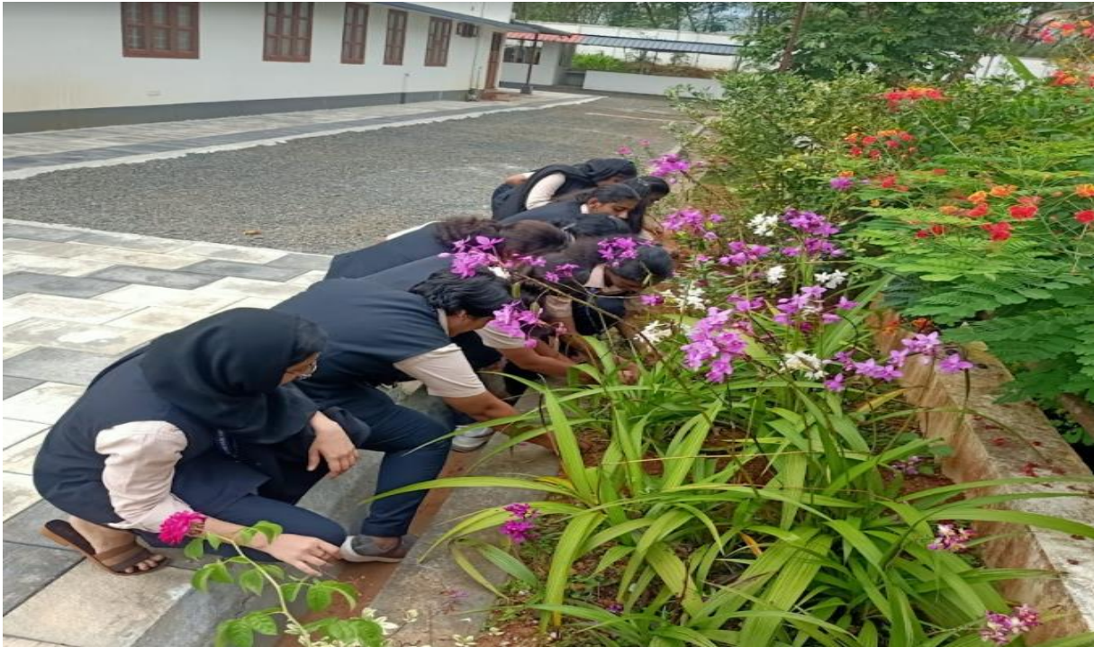
NSS & UBA Members Visited Sneha giri Psycho Social Home ,Pooparamba