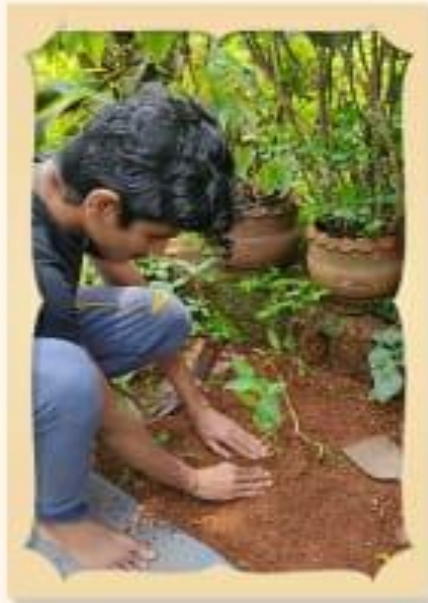
NSS VOLUNTEERS PLANTING TREES AT THEIR HOMES