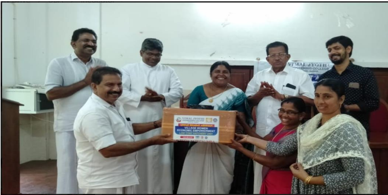
Handover the Hatchery unit developed by vjec students to Eruvessy Grama Panchayath authority.