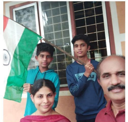
Flag Hoisting by Vimal jyothi staff and students at their homes