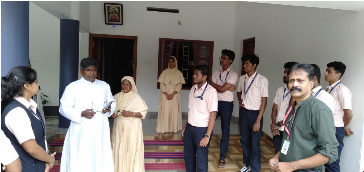
NSS students visited Maria Bhavan on World mental health day (10 October, 2022)