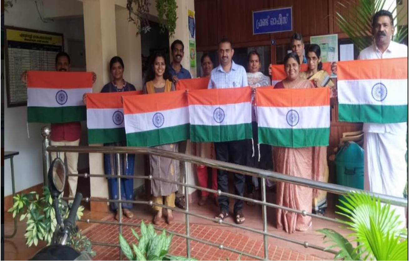
Independence Day Celebration: Flag Distribution by Panchayath President