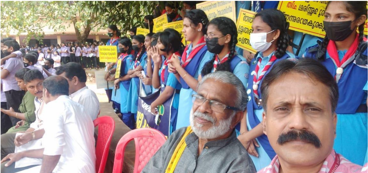
Anti Drugs awareness programme at Nirmala Higher Secondary School, Chemperi by NSS units of Vimal Jyothi ( January 2023 ).