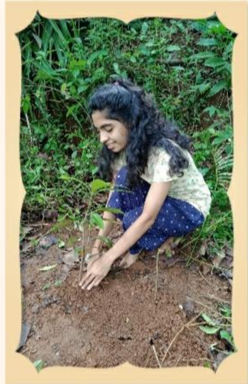
NSS VOLUNTEERS PLANTING TREES AT THEIR HOMES