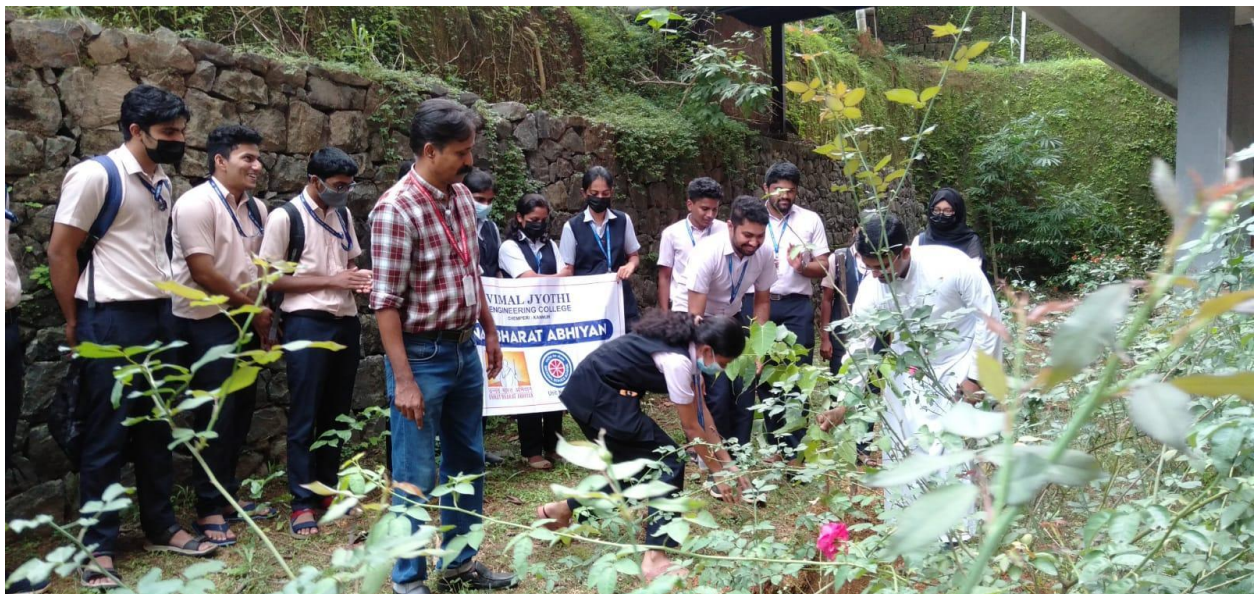
As part of World Environment Day celebration, NSS students planting trees at college Campus