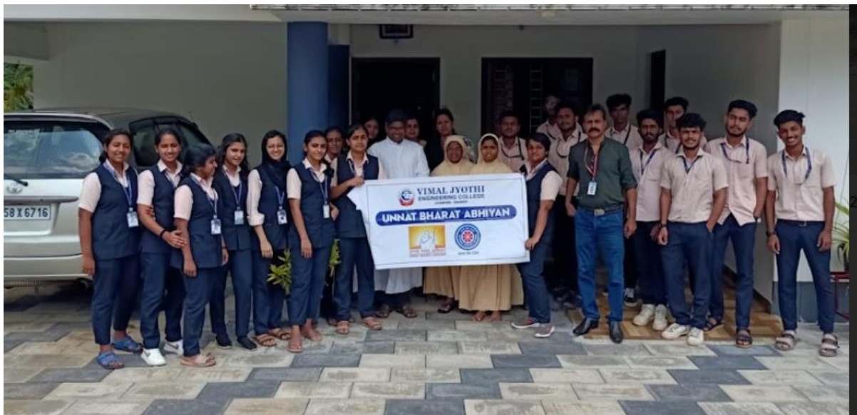
NSS & UBA Members Visited Sneha giri Psycho Social Home ,Pooparamba

Snehagiri Home is a charity home situated in one of the adopted Village. The students and staffs in our institution spend one full day with the inmates. They helped them for their daily activities and entertained the residents of the Centre with games, dance and songs.