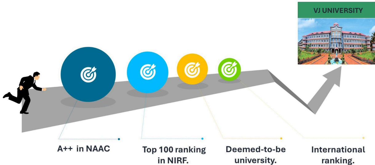
Fig.6.2.2 Long Term Goal