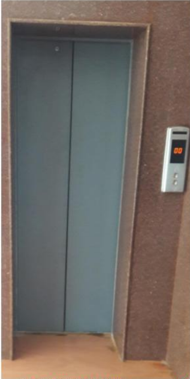
IDLE AT GROUND FLOOR