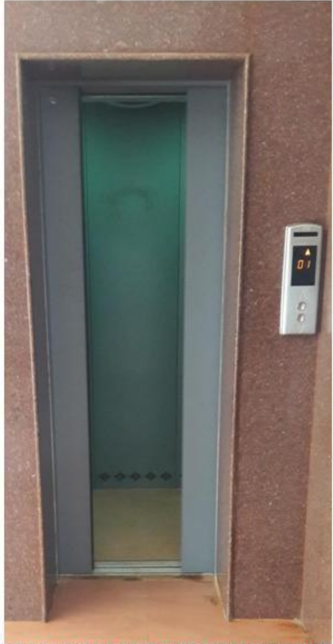
READY TO LOAD PASSENGERS FOR FIRST FLOOR