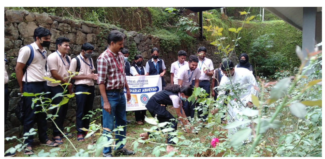
As part of World Environment Day celebration, NSS students planting trees at college Campus