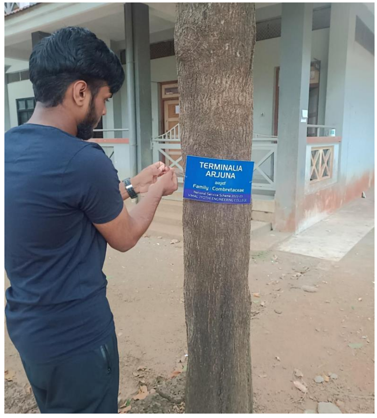
Tree Tagging at Vimal Jyothi campus