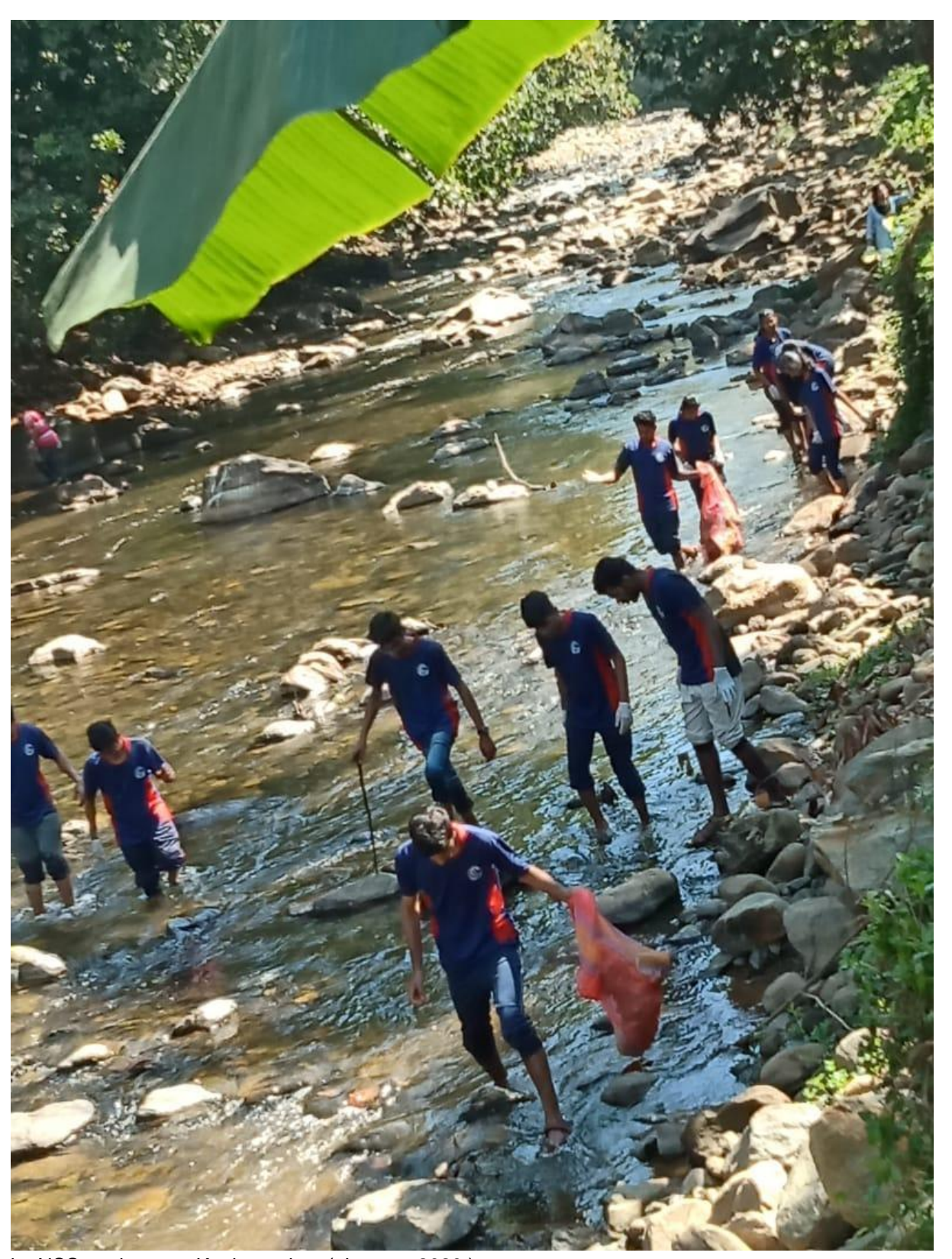
by NSS students at Kottiyoor river ( January 2020 ).