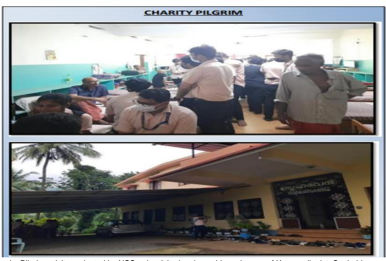
Charity Pilgrims visit conducted by NSS units, visited various old age homes of Kannur district, Snehabhavan

Each and every year NSS unit of Vimal Jyothi Engineering College conducts Charity Pilgrims. We used to conduct tours to visit old age homes of Kannur district. We are collecting grocery items and distributing the same to old age homes. We are conducting cultural programmes at every center. This year we have visited 10 centers and spent nearly 1 lakh rupees for this purpose. This programme is giving a wide experience to our younger budding engineers of our college.