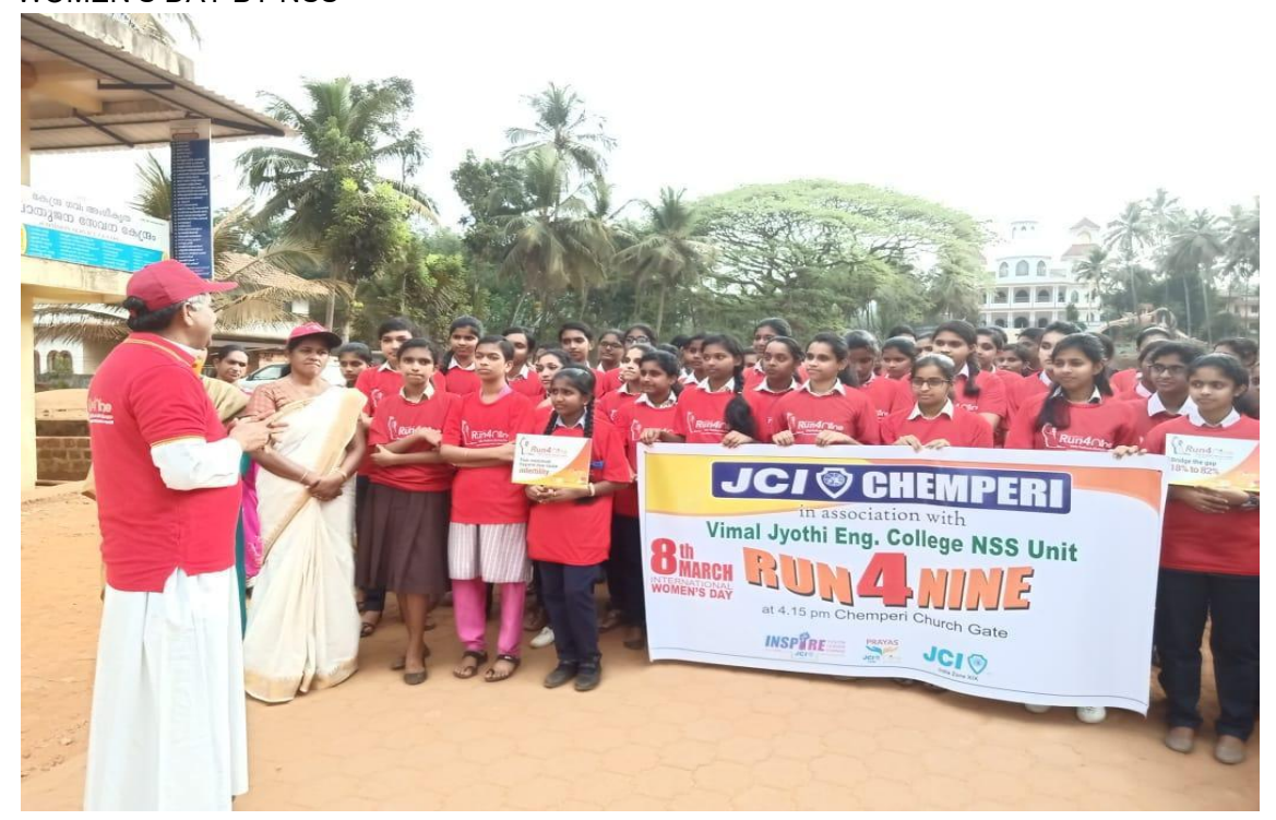
Women Empowerment Programme on Women's day by NSS students in association with JCI Chemperi (8 March 2019