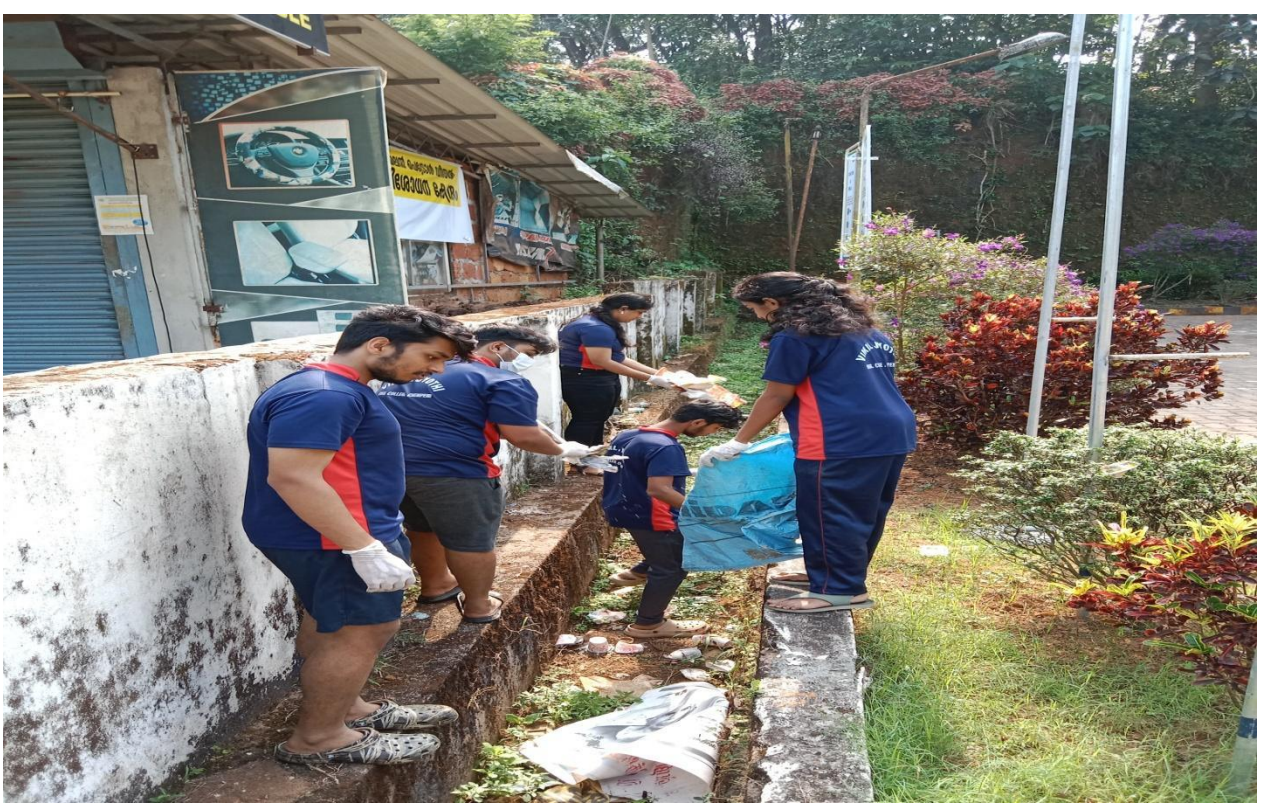
Chemperi town cleaning by VJEC NSS UNITS (18/12/2022)