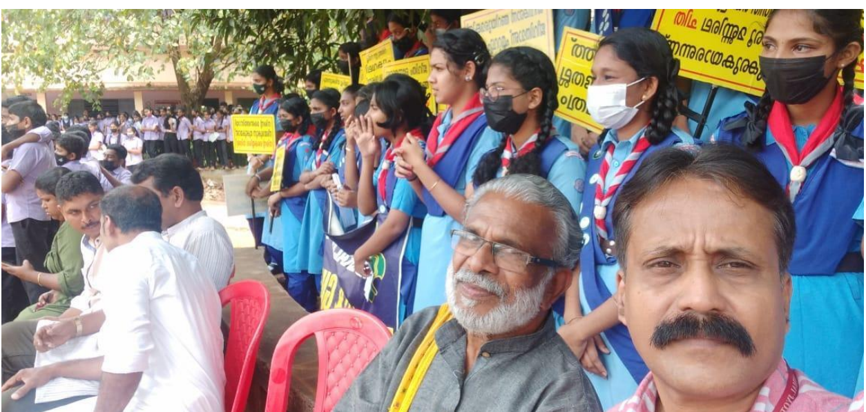
Anti Drugs awareness programme at Nirmala Higher Secondary School, Chemperi by NSS units of Vimal Jyothi ( January 2023 ).