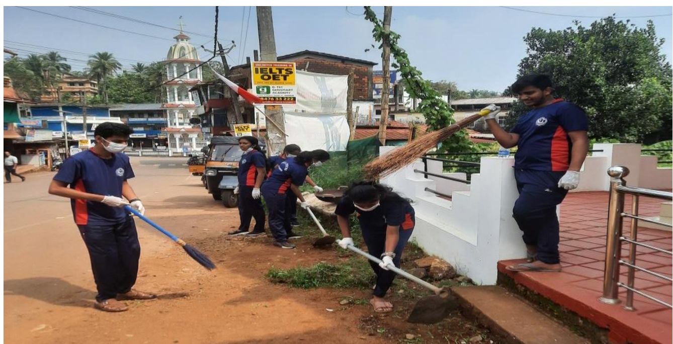
Chemperi town cleaning by VJEC NSS UNITS (18/12/2022)