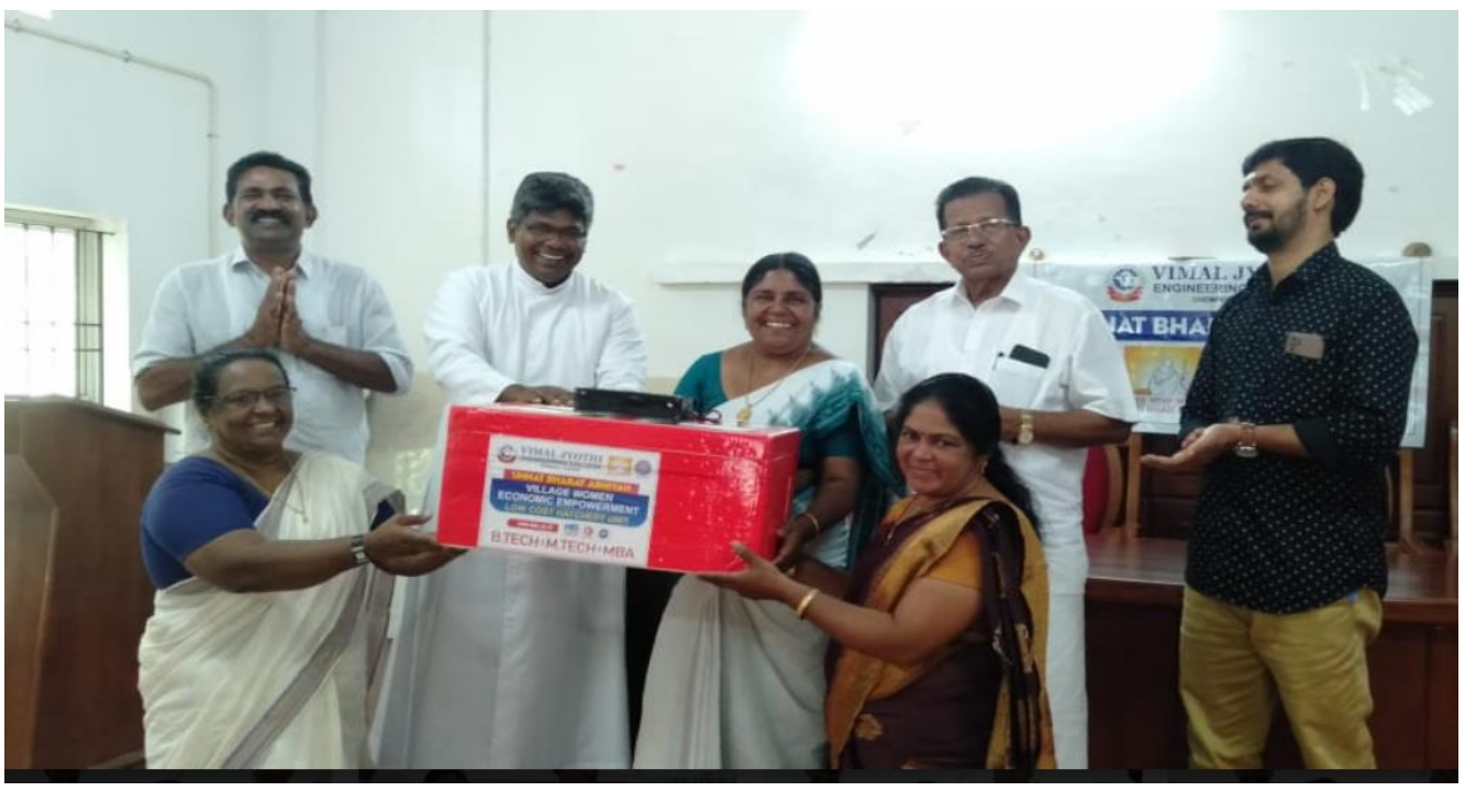
Handover the Hatchery unit developed by vjec students to Eruvessy Grama Panchayath authority.