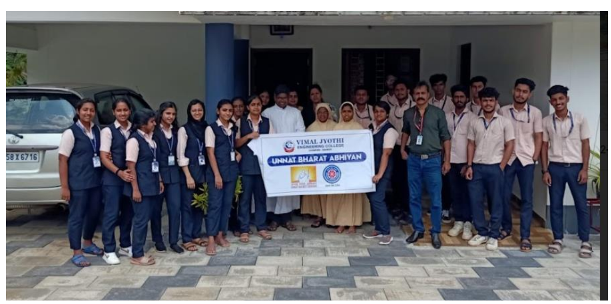
NSS & UBA Members Visited Sneha giri Psycho Social Home ,Pooparamba

Snehagiri Home is a charity home situated in one of the adopted Village. The students and staffs in our institution spend one full day with the inmates. They helped them for their daily activities and entertained the residents of the Centre with games, dance and songs.