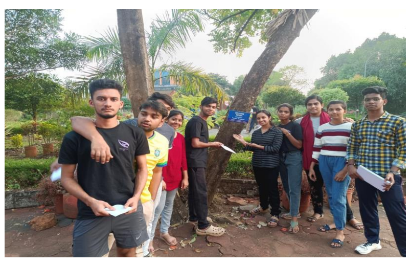
Tree Tagging at Vimal Jyothi Campus