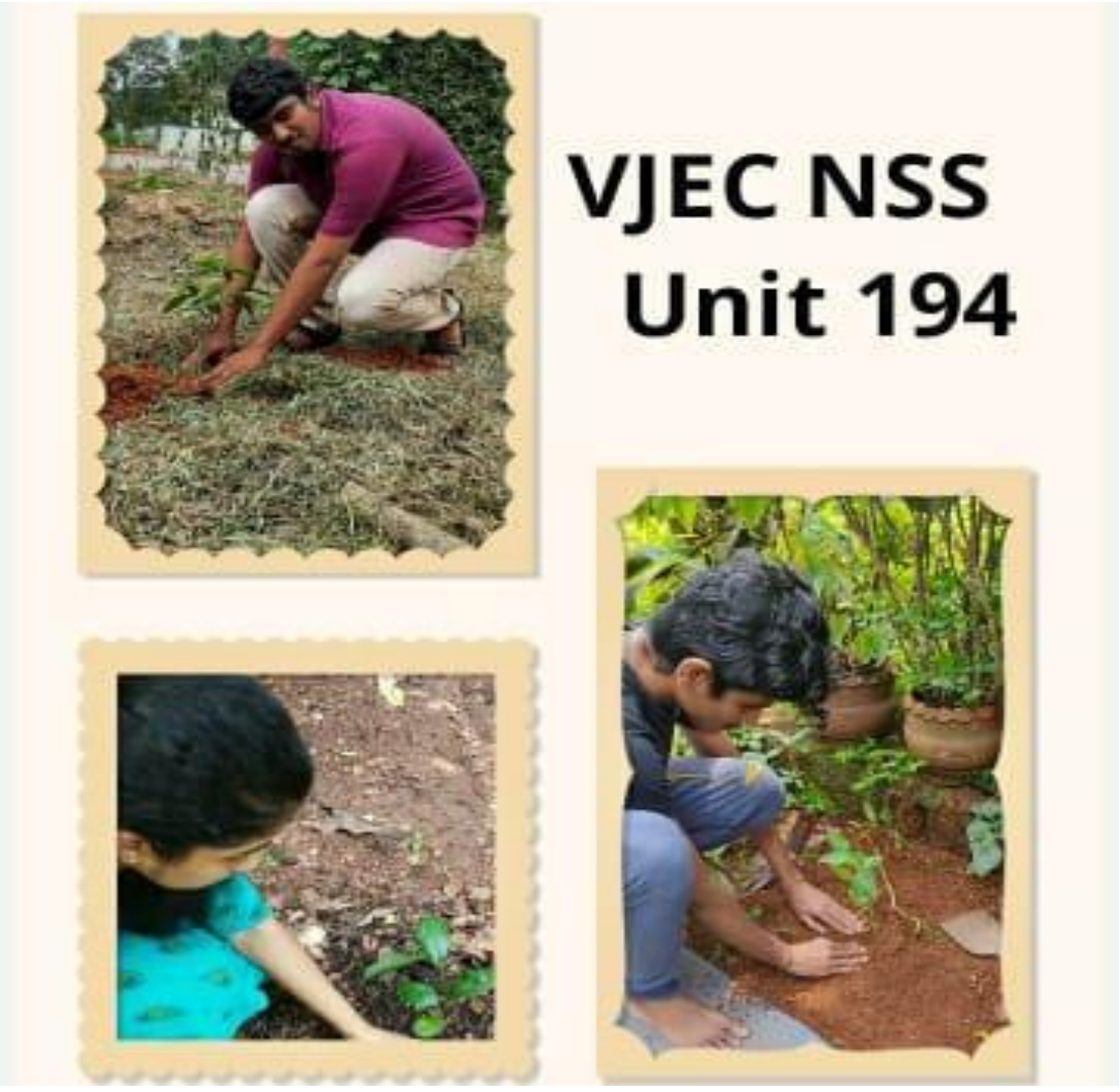
NSS VOLUNTEERS PLANTING TREES AT THEIR HOMES