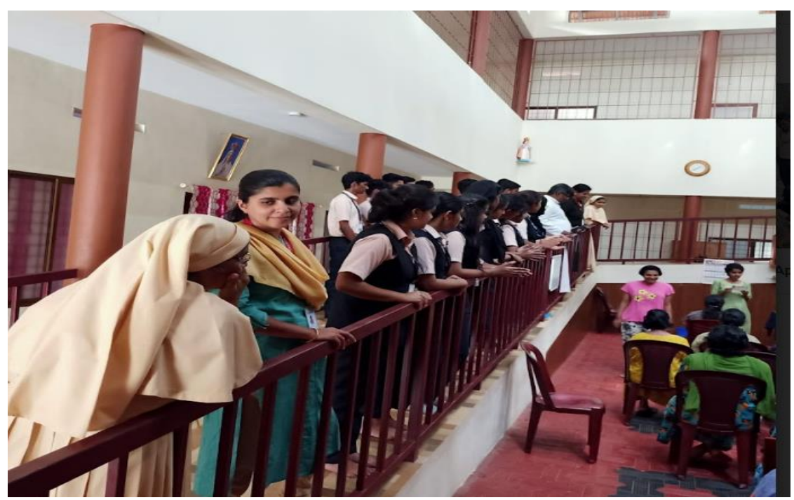
NSS & UBA Members Visited Sneha giri Psycho Social Home ,Pooparamba