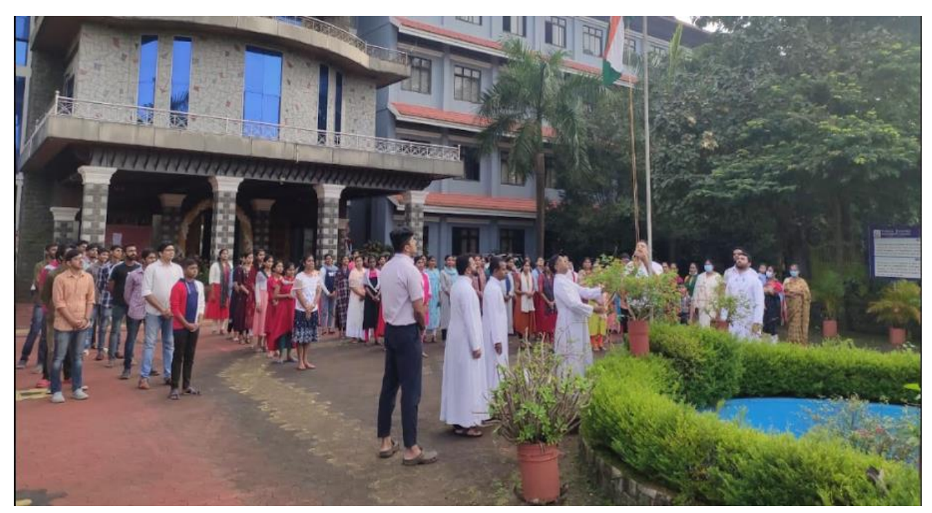
Flag Hoisting held at Vimal Jyothi Campus