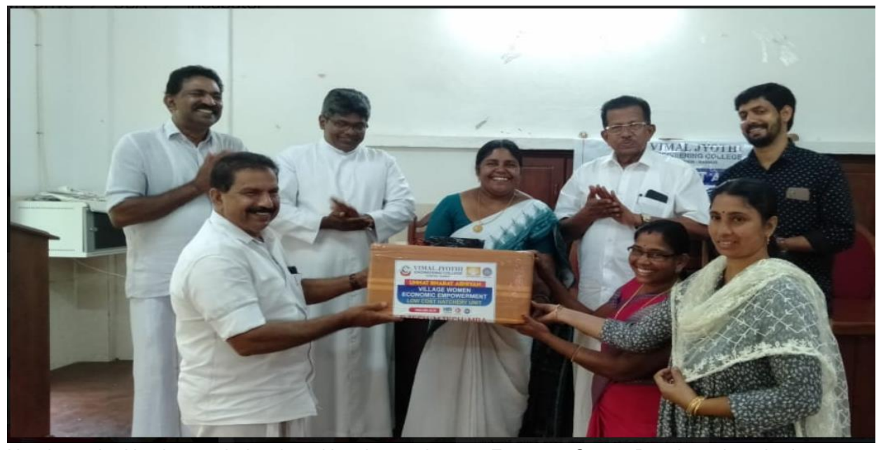
Handover the Hatchery unit developed by vjec students to Eruvessy Grama Panchayath authority.