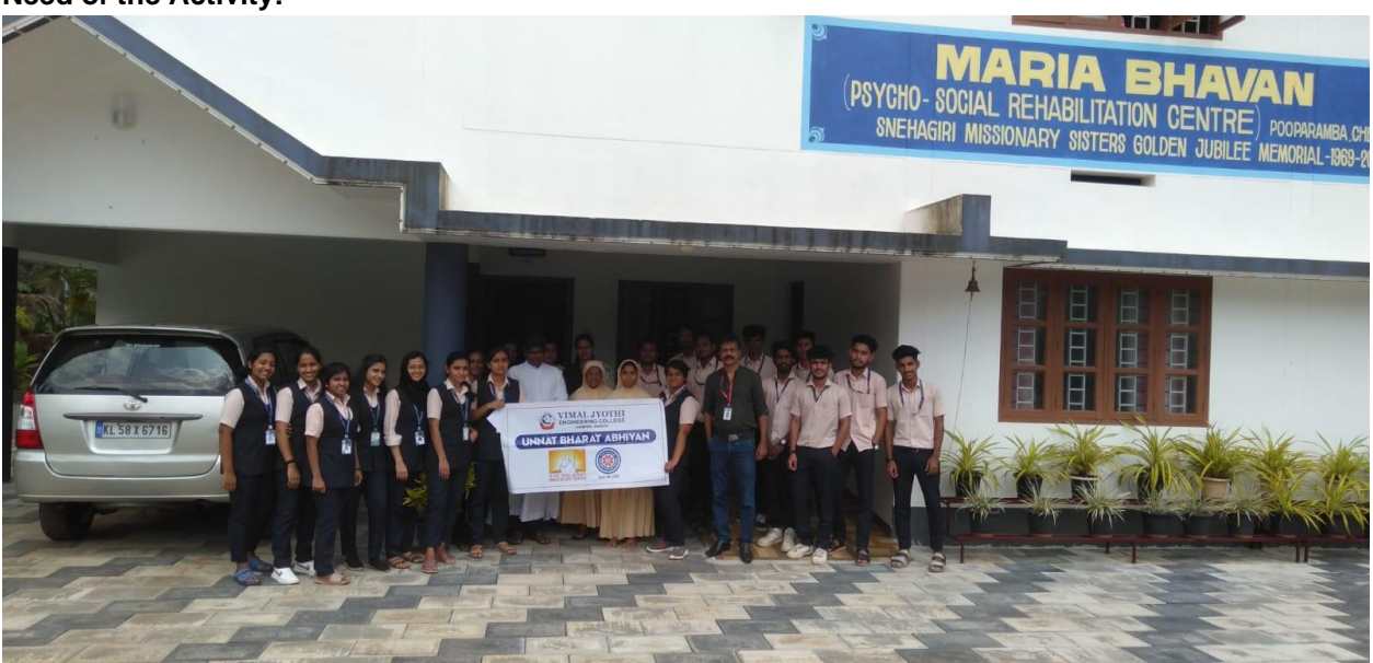
NSS students visited Maria Bhavan on World mental health day (10 October, 2022)