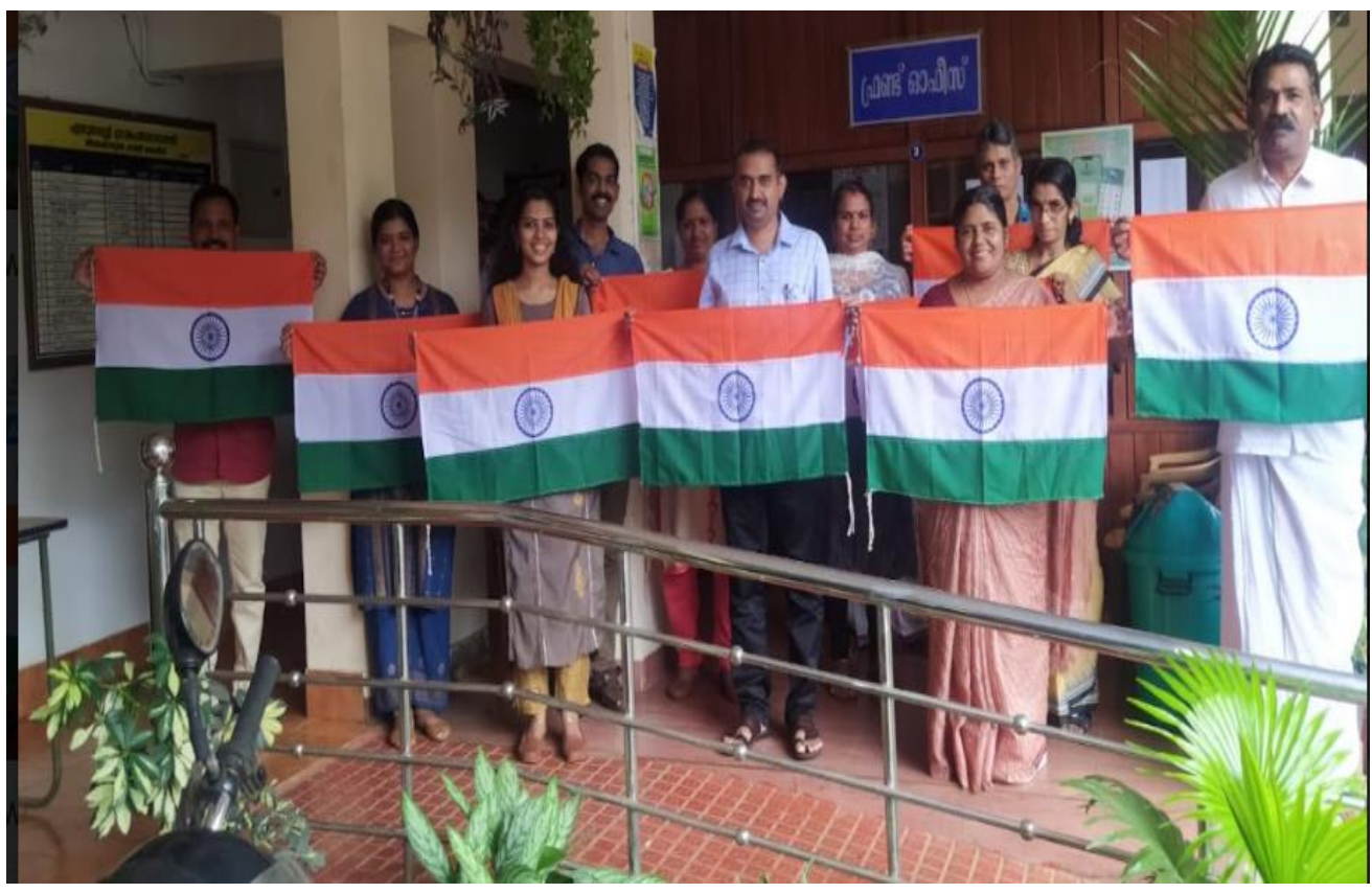
Independence Day Celebration: Flag Distribution by Panchayath President