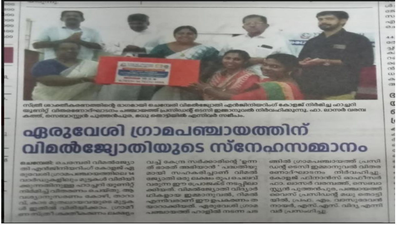
News came in the news paper about the distribution of Egg Hatching Unit