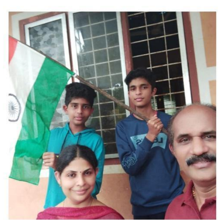
Flag Hoisting by Vimal jyothi staff and students at their homes