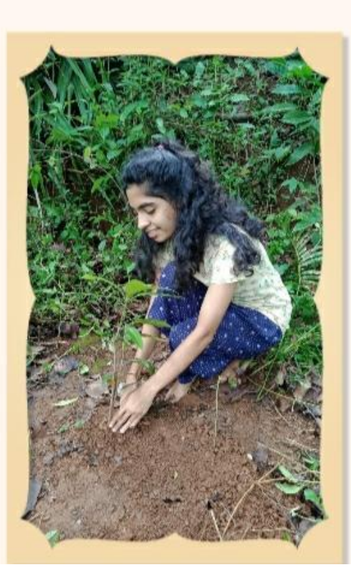
NSS VOLUNTEERS PLANTING TREES AT THEIR HOMES