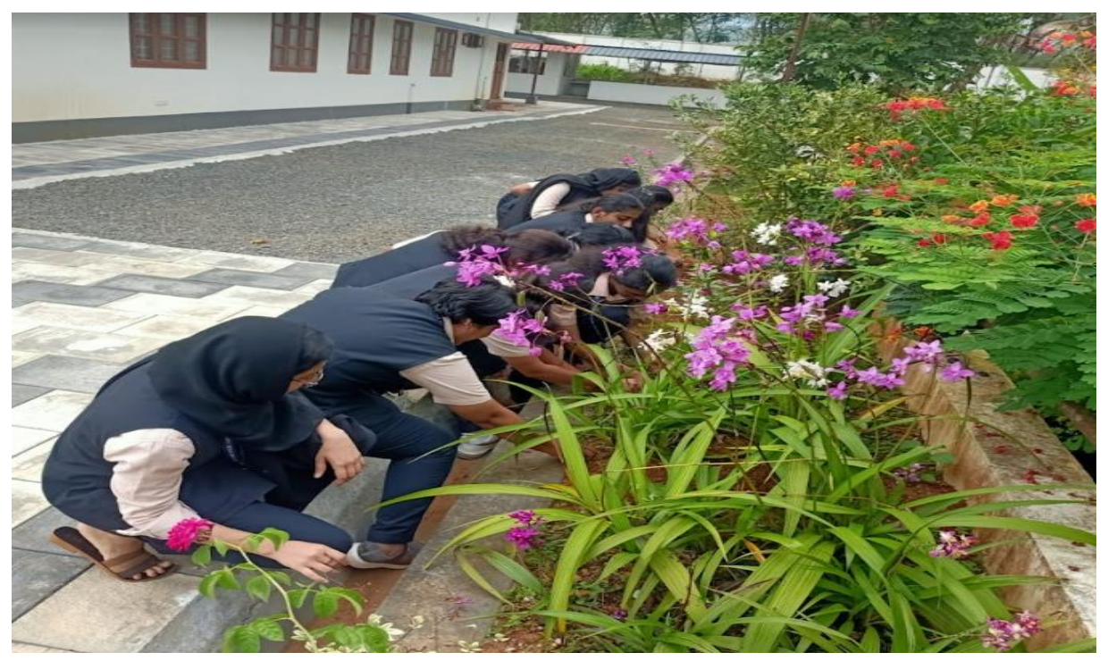
NSS & UBA Members Visited Sneha giri Psycho Social Home ,Pooparamba