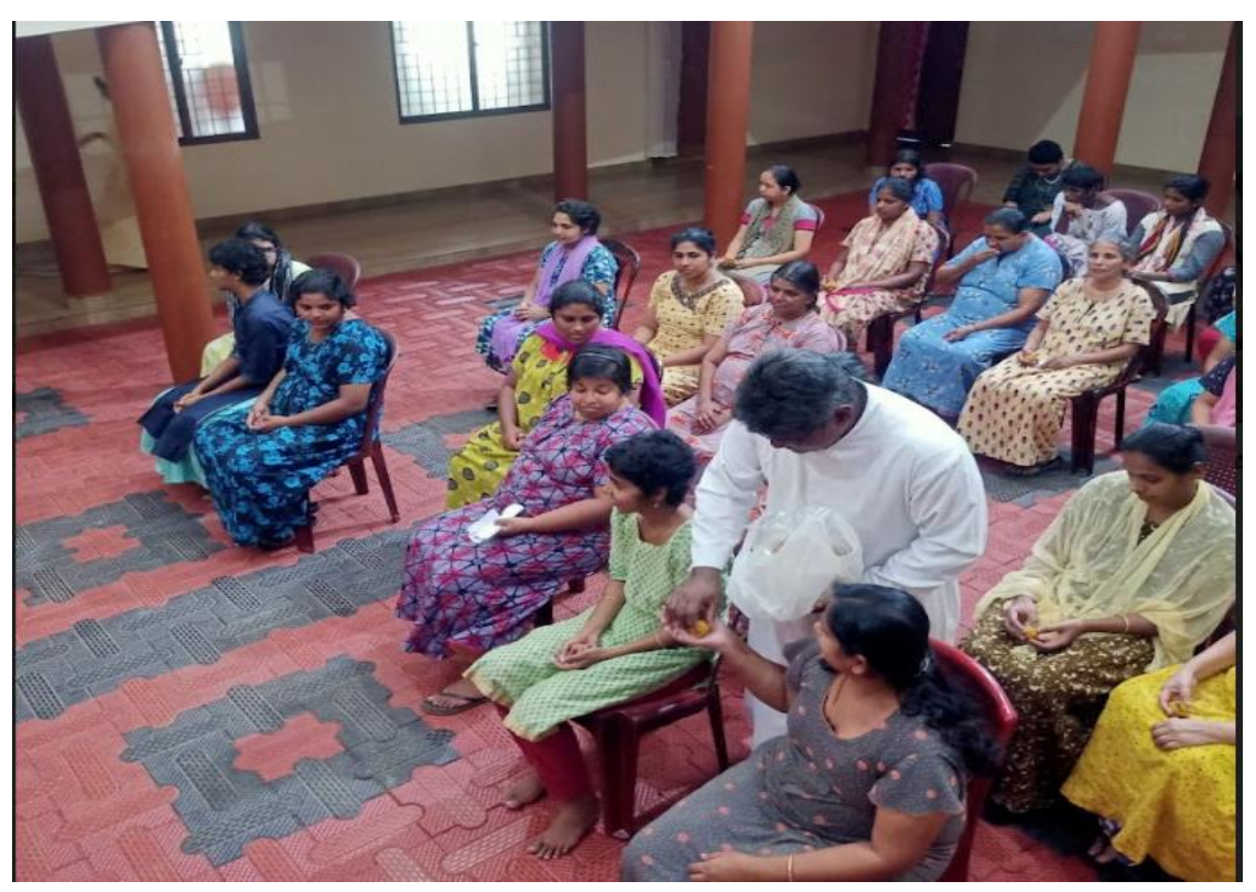
NSS & UBA Members Visited Sneha giri Psycho Social Home ,Pooparamba