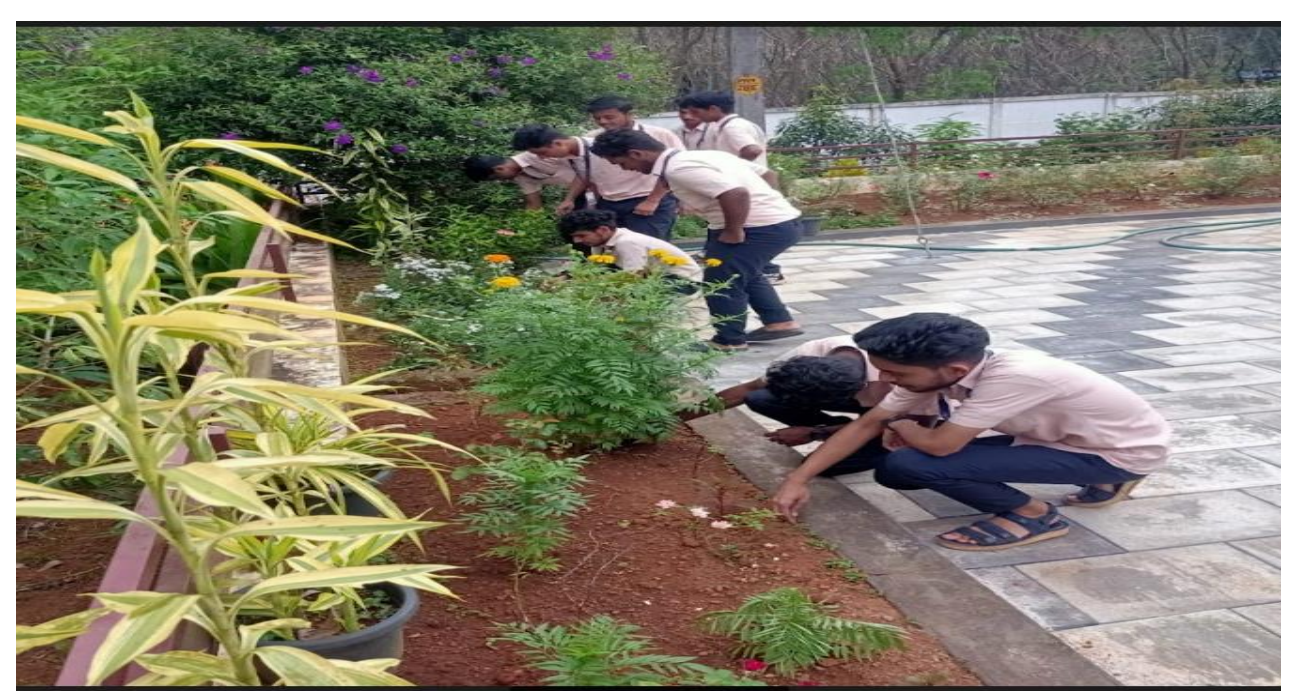
NSS & UBA Members Visited Sneha giri Psycho Social Home ,Pooparamba