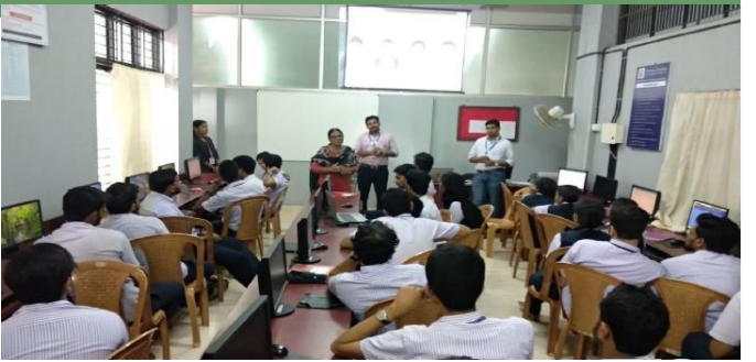
PLACEMENT TRAINING CONDUCTED BY SIG-MOS INDIA FOR FINAL YEAR STUDENTS DURING APRIL 11- 14.