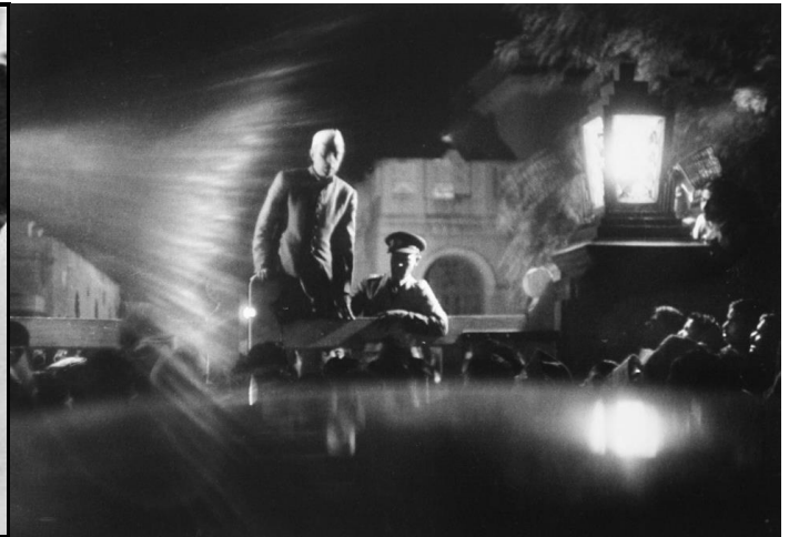
Prime Minister of India Mr. Jawaharlal Nehru, announcing the death of Mahatma Gandhi at the Birla house on 30 Jan. 1948 nearing mid-night.

The above shown two photographs were taken by Henri Cartier-Bresson (Aug. 22, 1908 – Aug. 03, 2004) who was a French humanist photographer considered as the master of candid photography, and an early user of 35 mm film. He pioneered the genre of street photography and viewed photography as capturing a decisive moment . He was one of the founding members of Magnum Photos in 1947. In the 1970s he took up drawing, he had studied painting in the 1920s. His photographs, paintings and himself have been subject for more than 50 books from 1946 till today. He has directed 6 art films and 3 films have been taken on His life history and his works. 9 films have been compiled from his photographs.